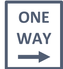
ONE WAY FLOW thru clinic - Enter via Front Door and Exit via Back Door