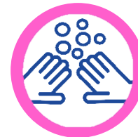
More frequent hand hygiene