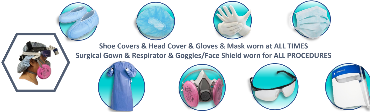
Shoe Covers & Head Cover & Gloves & Mask worn at ALL TIMES Surgical Gown & Respirator & Goggles/Face Shield worn for ALL PROCEDURES