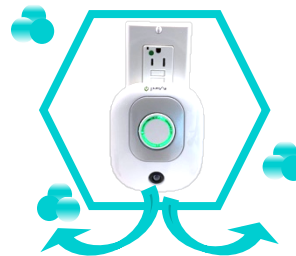
AIR PURIFICATION with ACTIVATED OXYGEN & IONIZATION in Each Patient Room