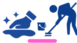
More frequent disinfection of all surfaces