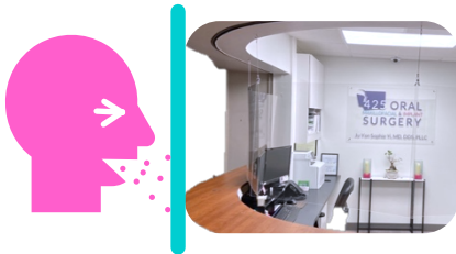
SNEEZE GUARDS INSTALLED at the Reception Desk