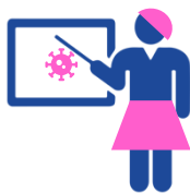
Staff training on COVID-19 and new safety protocols